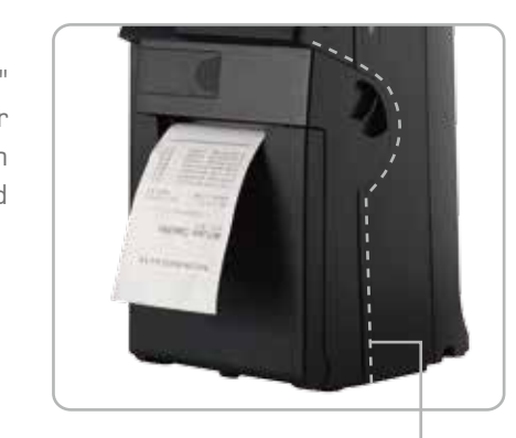
Detachable Receipt Printer •

The HS-3500 Series integrates the most widely used peripherals including 3" thermal printer, MSR, fingerprint sensor, 2D barcode scanner and 2<sup>nd</sup> customer display to support your daily POS operation. The detachable modularized design allows quick access to the components, enabling fast and easy service and upgrades.