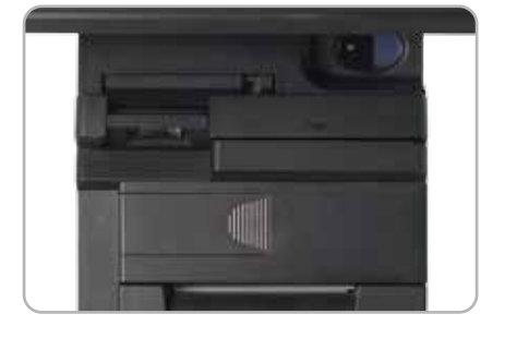
Optional Built-in MSR Fingerprint Sensor and RFID Reader