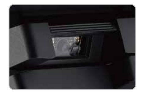
2D Barcode Scanner

Dressed from head to toe in timeless black or white color, the only trend that never goes out of style, and with stylish touches added throughout, the HS-3500 Series is not just a piece of machinery, it is an elegantly crafted piece of art that looks right at home in any store decoration.