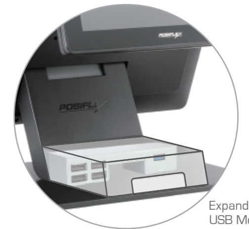
Expandable USB Module

Advanced cable management design delivers a truly clutter-free station. The standard base can house the optional Powered USB or USB extension module, while the optional base integrates a UPS backup (RB-5000) for the event of a power failure.