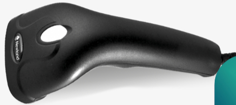
HR1250-70 Anchoa handheld scanners