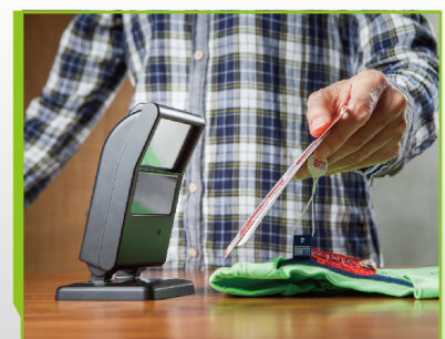
Adjustable body angle