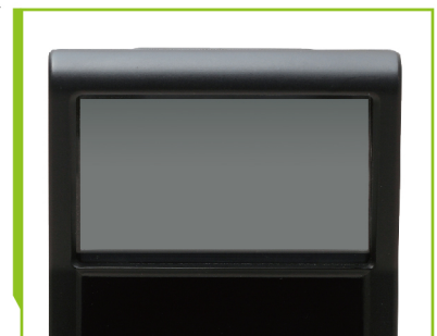
Wide scan angle

DT-6800 engineered wide angle lens to decode most of standard 1D, PDF and 2D codes easily. Mobile phone and poorly printed codes are readable. Retailers can accommodate customers who download mobile coupons, mobile loyalty cards and more. Restaurants can accept mobile coupons at the register. Hotels can allow guests to use electronic loyalty cards stored on their mobile phones, eliminating the need to carry physical cards. Theaters, theme parks and stadiums can scan mobile tickets as easily as a paper ticket. They can offer customers an added convenience: paperless ticketing.