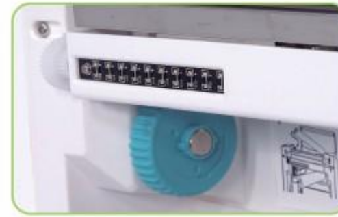
See-through sensor (Auto Detection)