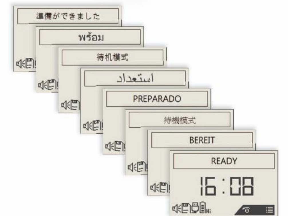
Multilingual LCD Display