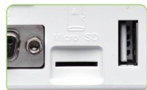
Micro SD card Slot(Up to 32 GB)