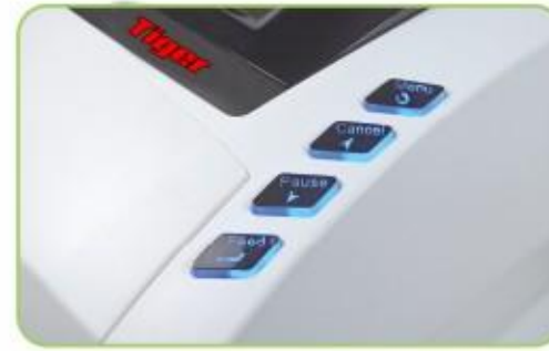
4 function buttons + flash indication