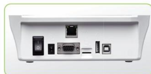
Full communication ports