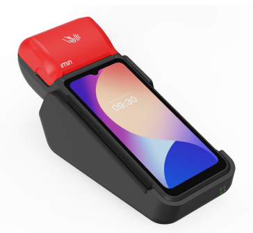
Charging Compatible with charging dock.

Ultra-large Display 6.5", 720 x 1600 display screen with an ultra thin bezel design.