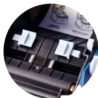
Support Multi-type of Labels