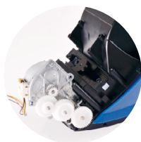
Big Gear, High Reliability